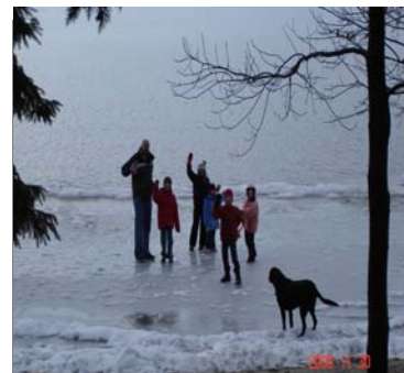
Winter on Black Lake