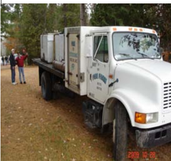
The walleye have arrived !

Our thanks go out to everyone for their help and support in this effort.