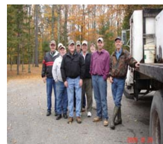
VIRGIL AND THE FISH PLANTING CREW

As you can imagine, BLA activities require a lot of effort. Last year we had 501 memberships with a core group of 25 to 30 attending