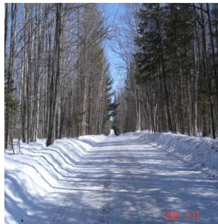
A quiet, winter road on Black Lake

The Michigan Riparian ran a story about a Wisconsin family who has developed a "lotion" to prevent swimmer's itch. They mixed up their own "swimmer's itch block" with a 30SPF sunscreen and claim that it works. The only glitch is that mom and dad have to remember to apply the lotion to their children. They claim they had a total of 240 grandkid days at their cabin last summer and that they were in the water 90% of the time with NO swimmer's itch. They were so happy they have decided to sell their product. If you are interested in trying their lotion you can find them at, noswimmersitch.com .