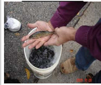
Walleye fingerling about to be planted